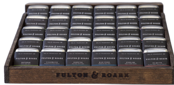
Large Solid Fragrance Display (wood): 5" (H) x 13½" (W) x 12" (D)