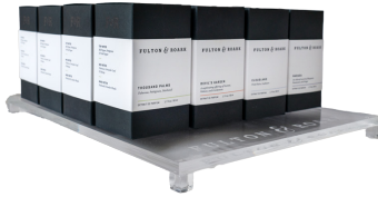
Extrait de Parfum Display (clear acrylic): ¾" (H) x 10" (W) x 13" (D)

A well-stocked display gives shoppers a great first impression of F&R, making the retailer's job easier. All options are available at no charge with any suggested opening orders.