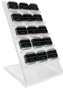
Solid Fragrance Display (clear acrylic): 12 ¾" (H) x 8 ¼" (W) x 8" (D)