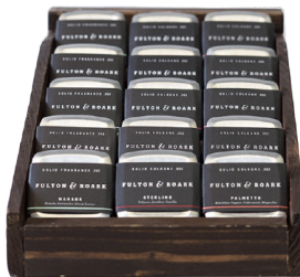
Small Solid Fragrance Display (wood): 5" (H) x 7" (W) x 12" (D)