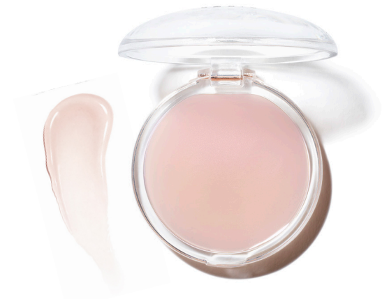
ORIGINAL clear semi glossy finish