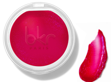
BEDROOM glossy sheer raspberry tint with violet iridescence