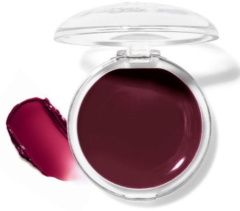
BITTEN sheer juicy boysenberry