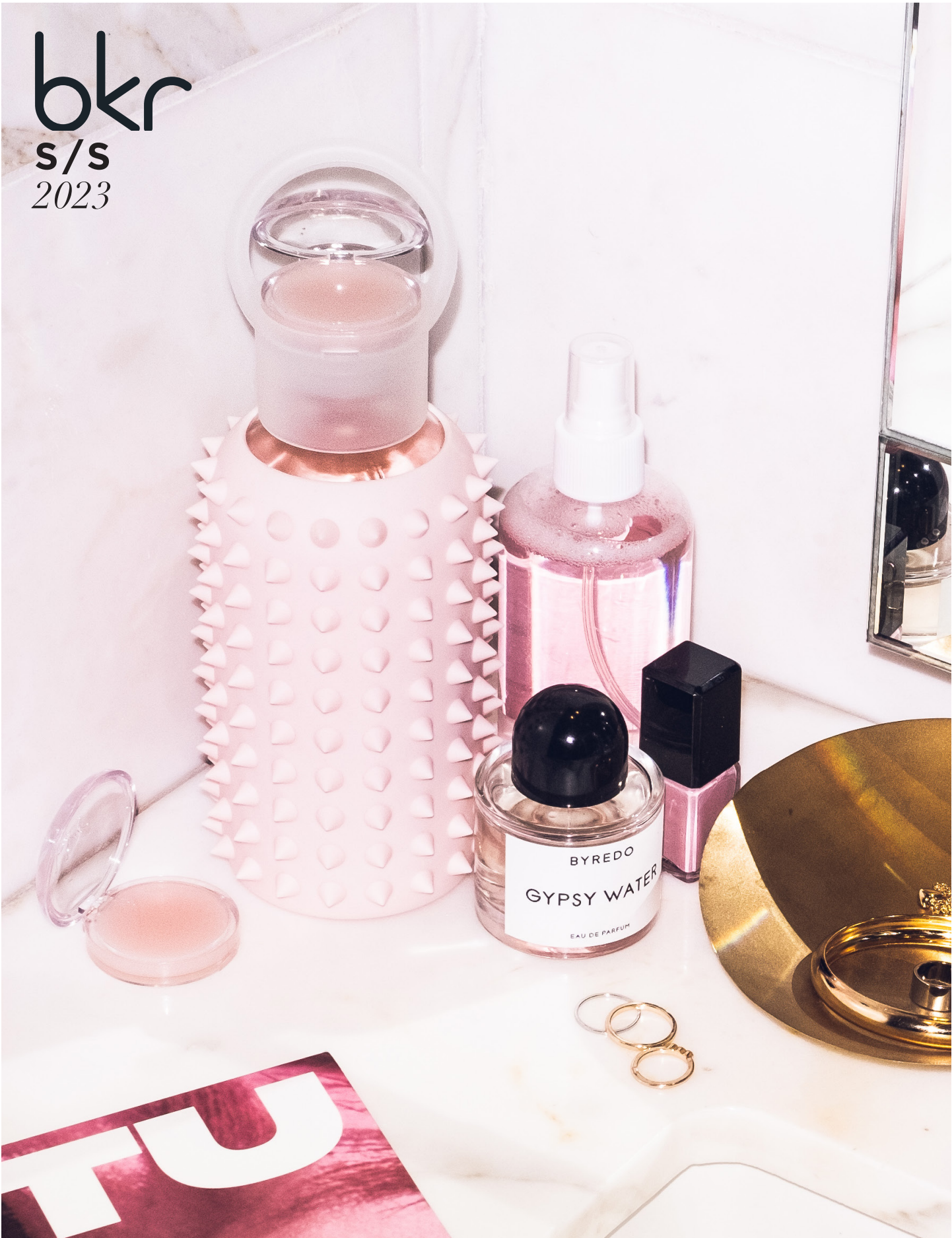
YOUR WATER BOTTLE SOULMATE