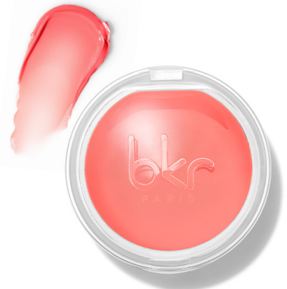
ELLE sheer glossy coral