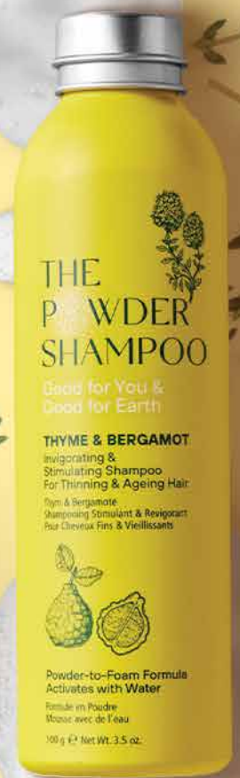
100g/3.5oz Aluminium Refillable Bottle