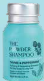
20g/0.70oz Aluminium Refillable Bottle