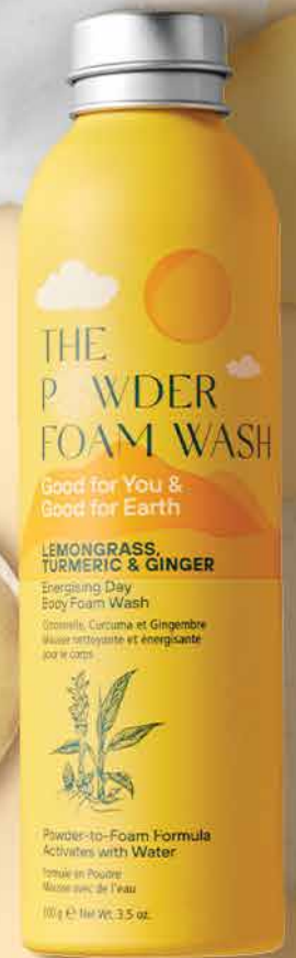
100g/3.5oz Aluminium Refillable Bottle