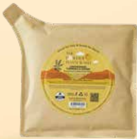
100g/3.5oz Paper Refill Pouch