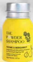
20g/0.70oz Aluminium Refillable Bottle