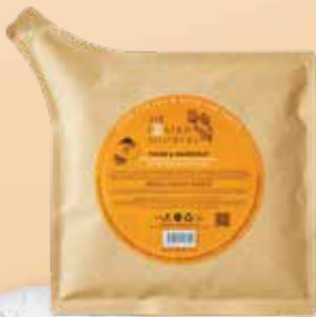
100g/3.5oz Paper Refill Pouch