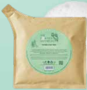
100g/3.5oz Paper Refill Pouch