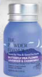
20g/0.70oz Aluminium Refillable Bottle