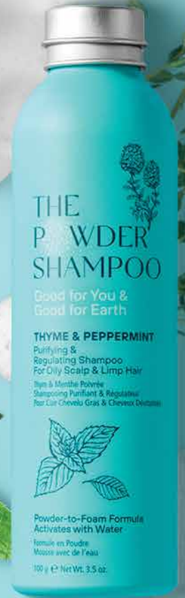
100g/3.5oz Aluminium Refillable Bottle