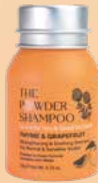
20g/0.70oz Aluminium Refillable Bottle