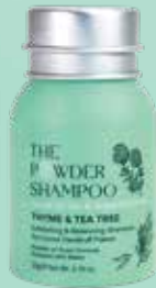
20g/0.70oz Aluminium Refillable Bottle