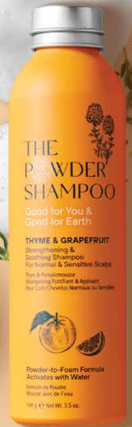
100g/3.5oz Aluminium Refillable Bottle