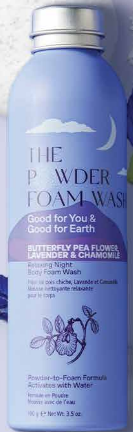
100g/3.5oz Aluminium Refillable Bottle