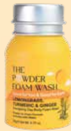
20g/0.70oz Aluminium Refillable Bottle