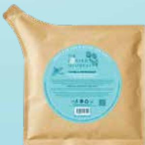
100g/3.5oz Paper Refill Pouch