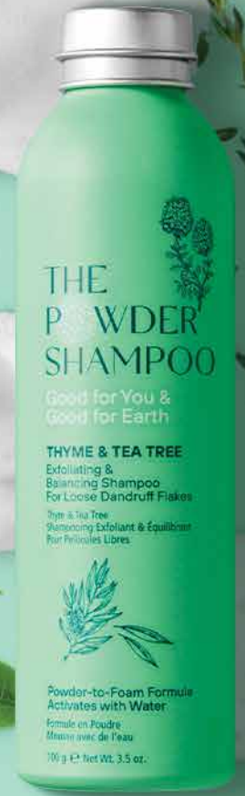
100g/3.5oz Aluminium Refillable Bottle