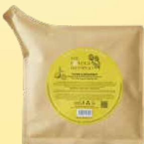
100g/3.5oz Paper Refill Pouch