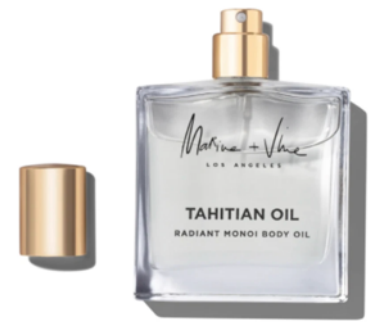
Tahitian Oil Radiant Monoi Body Oil, $62 at Marine + Vine