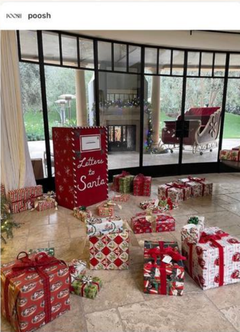
poosh The greatest gift to give yourself this year? Staying in budget. We've rounded up our favorite under $100 and under...