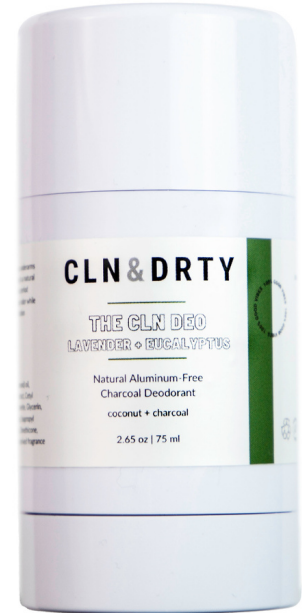
The CLN Deo in Lavender + Eucalyptus $13 MSRP $26

A natural, aluminum-free deodorant featuring charcoal and arrowroot powder for odor neutralization.