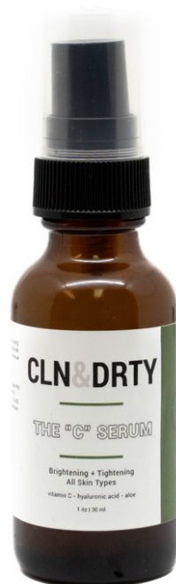
The "C" Serum $20 MSRP $40

Naturally brightens, improves skin texture and reduces the appearance of dark spots and hyper-pigmentation for a new found glow.