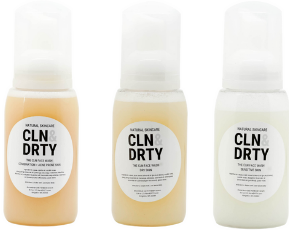
The CLN Wash Bundle $171 MSRP $342

Product Category: Bundles Delivery within 3 weeks Minimum opening order: 3 individual SKUs + 3 of each SKU Minimum follow up order: 3 of each SKU