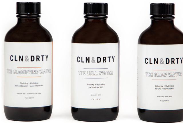
The Toners Bundle $135 MSRP $270

An easy to merchandise and educate bundle of our new Toning Waters. Color coded by skin type for a quick and easy sale. Features eco friendly glass bottles.