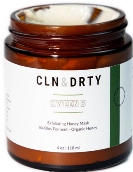
The Kween B - Organic Honey Exfoliating Mask $32 MSRP $64

Product Category: Facial Treatments Delivery within 3 weeks Minimum opening order: 3 individual SKUs + 3 of each SKU Minimum follow up order: 3 of each SKU