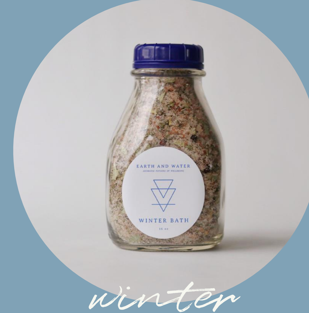
16oz - $25

Falling for this spicy earth blend. Designed perfectly for the Harvest Season, to make you feel warm and cozy on those crisp cool nights.