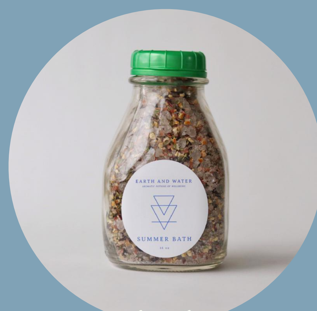
8 mmer 160z - $25

This Spring batch is all about renewal. Like a new plant budding up from the earth. You will feel refreshed and renewed as you submerge yourself in Spring's delight.