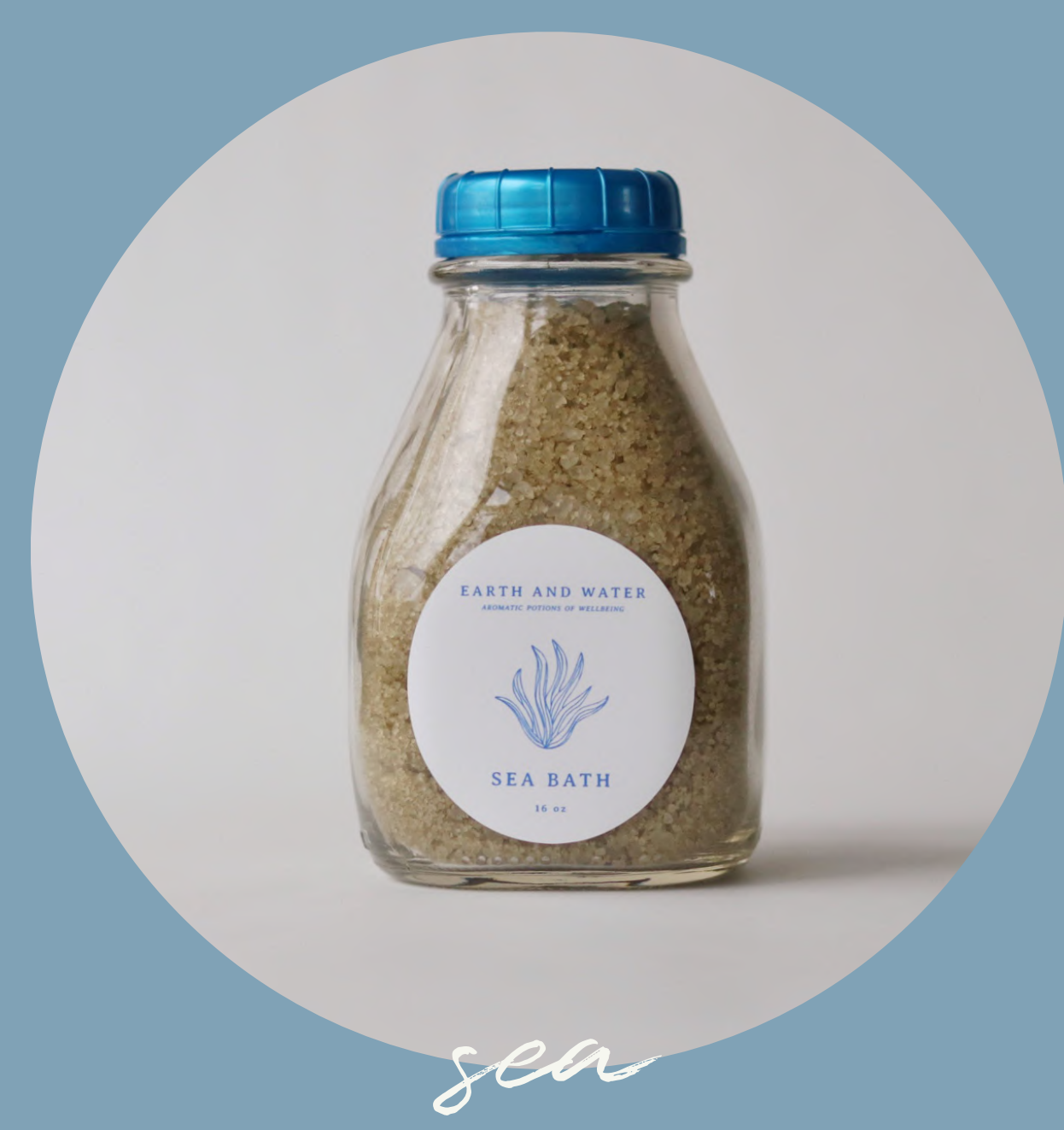
16oz - $35

Finally a good reason to play in the mud! The therapeutic qualities of mud are endless and have been used for thousands of years. Now, you will not only be connected to the ancient ones, but also feel your inner child emerge as you enjoy your very own mud puddle.