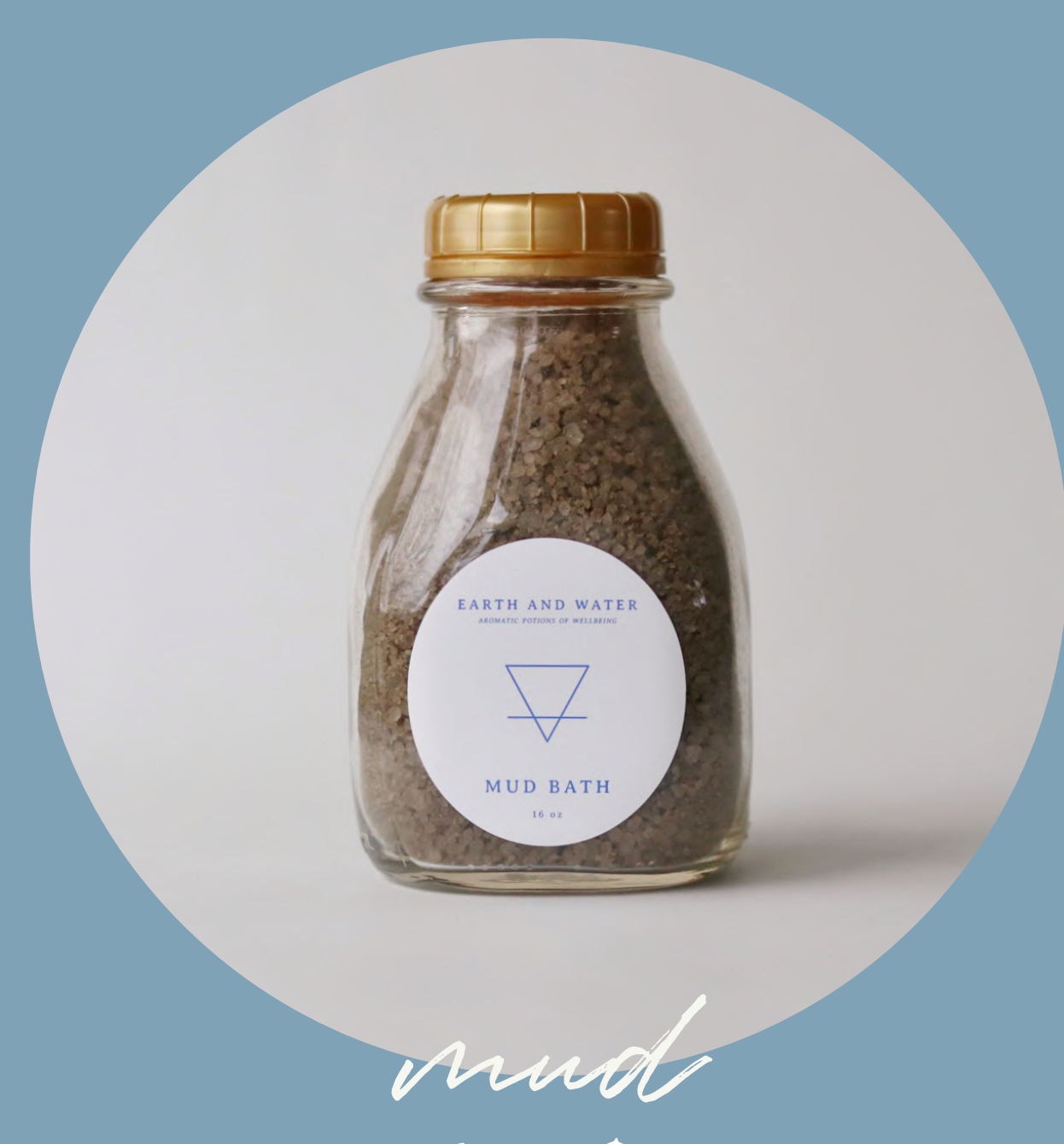
16oz - $35

Bathing in the Mother Milk. Submerging yourself in the total essence of femininity. The power of this life giving force will make your skin feel supple and soft while exfoliating. You will reemerge with your skin feeling like your first day on Earth.