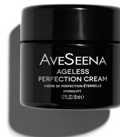
Perfection Cream Fine lines + Firms $157.00 | 1.5 oz

Contains +30 Botanical Actives Key actives: Snow Mushroom, Resistem™, Squalane, Niacinamide, Peptide complex, Diamond, Arnica, Rose extracts