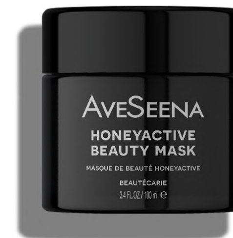
Beauty Mask Nourish + Brighten $79.00 | 3.34 fl oz

Contains +12 Botanical Actives Key actives: Honey, French Kaolin, Camelia, Neroli, Cocoa, Sweet Orange oils