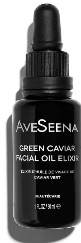
Green Caviar Oil Smooths + Plumps $125.00 | 1.0 fl oz

Contains +15 Botanical Actives Key actives: Matrixyl 3000™, Squalane, Green Caviar Algae Oil, Bakuchiol, Vitamin C and Vitamin E