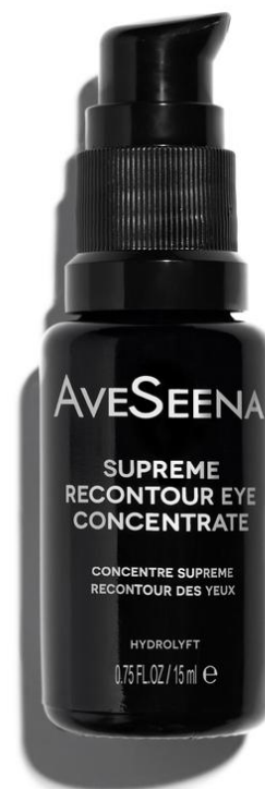
Eye Concentrate Firms + Puffiness $105.00 | 0.75 fl oz

Contains +18 Botanical Actives Key actives: Niacinamide,, Snow Mushroom, Petides, Beautifeye™, Amethyst, Rose, Arnica, Gotu Kola