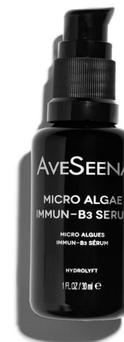
B3 Serum Lifts + Brightens $105.00 | .75 fl oz

Contains +18 Botanical Actives Key actives: Micro algae, Nannochloropsis Oculata, Niacinamide, Bearberry, Diamond, Licorice extracts