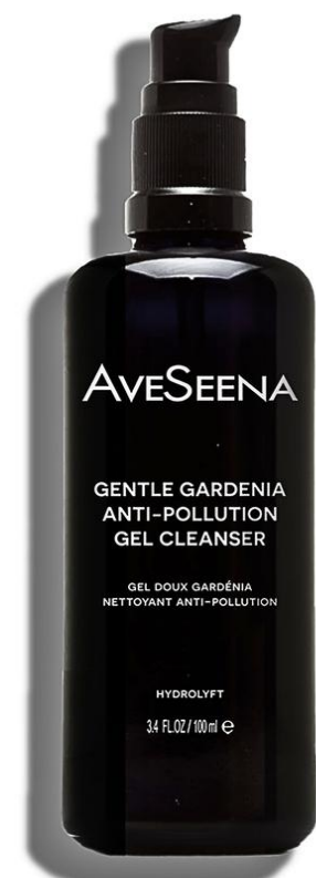
Gardenia Cleanser Hydrate + Brighten $48.00 | 3.34 fl oz

95% agree skin looked healthier 90% clear and brighter looking skin 90% noticed extra boost of moisture 80% appearance of lines + wrinkles improved