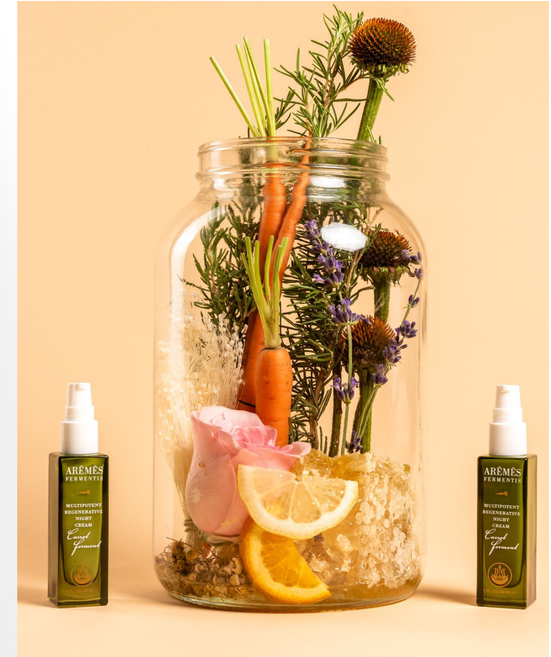
Multipotent Regenerative Night Cream carrot ferment $73

The Multipotent Regenerative Night Cream was designed to create a protective matrix on the skin while penetrating deep into the skin's cells that activate regeneration; delivering hydration, tightening, nutrition, protection, and correction at the source.