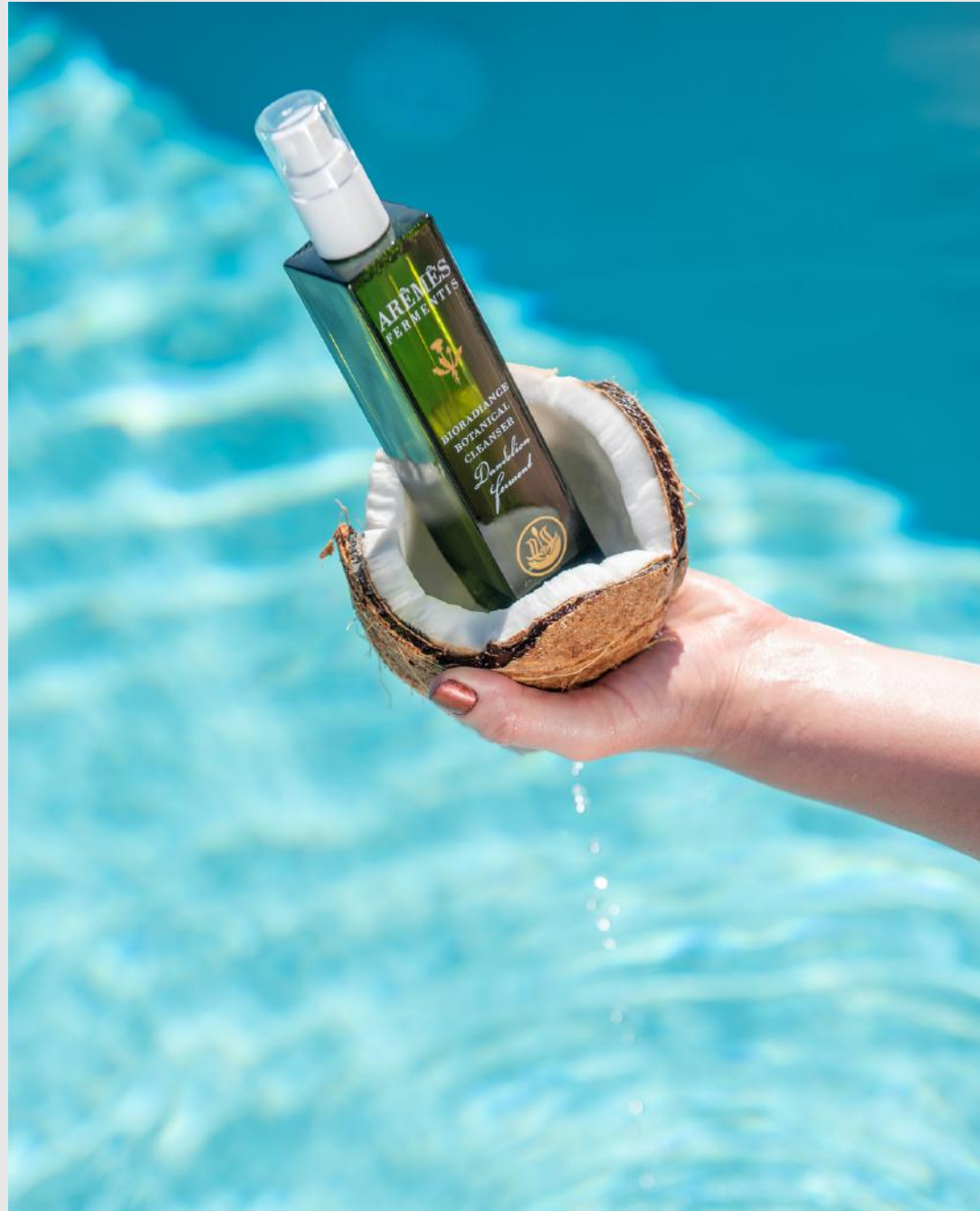
BioRadiance Botanical Cleanser dandelion ferment $42

The BioRadiance Botanical Cleanser is a foaming and non-stripping formula that delivers skin-barrier protecting, detoxifying, anti-inflammatory, and soothing properties that will leave your skin feeling soft, rejuvenated, and prepped for what's next in your skincare routine.