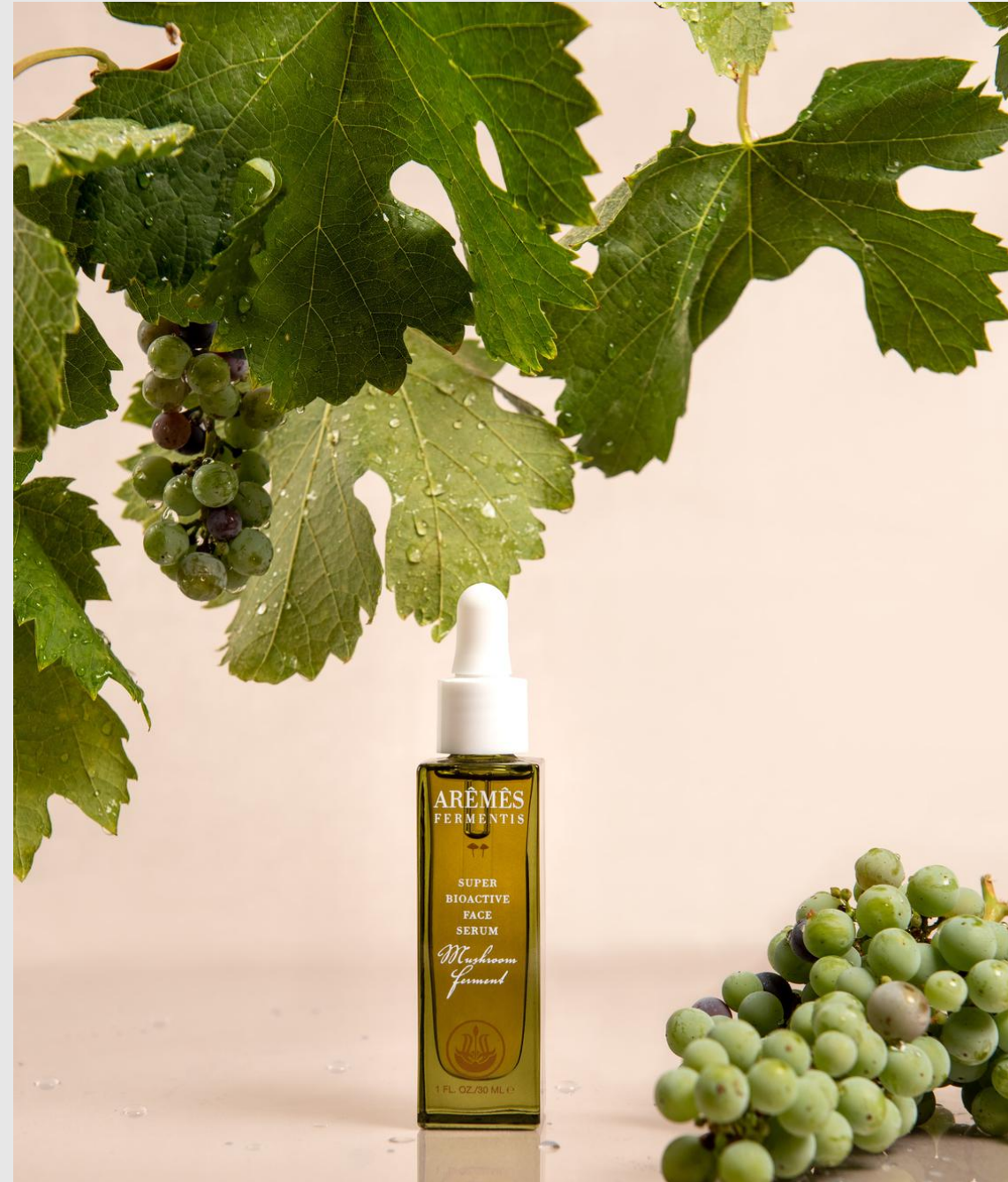
Super Bioactive Face Serum mushroom ferment $115

Super Bioactive Face Serum is a nutritive, restorative, and multi-correctional formula designed to balance the microbiome and deliver hydration, protection, brightening, anti-aging, anti-inflammatory, nutrition and balance to the skin's overall complexion.